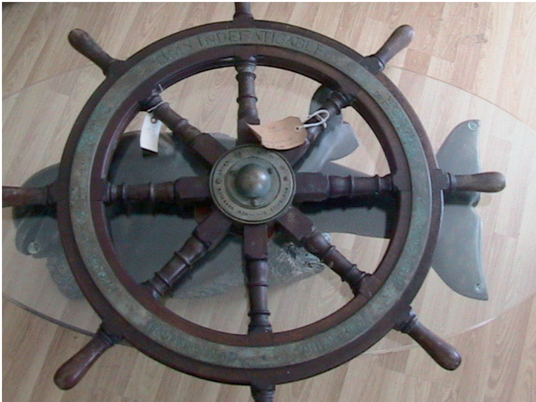
Battle honours engraved on the steering wheel of HMS Indefatigable