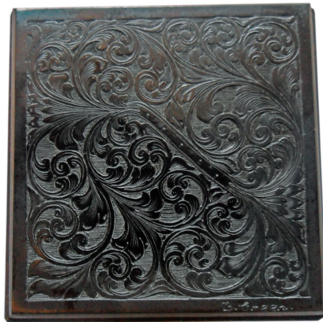
Two examples of Barry's work made for the Paperweight Collection, as part of Cut in Clerkenwell project 2012 -13