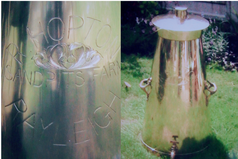
Milk churn engraved for display on a 1936 horse-drawn milk float which was part of the Golden Jubilee procession for the Queen in 2012